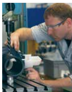
Customizing and training