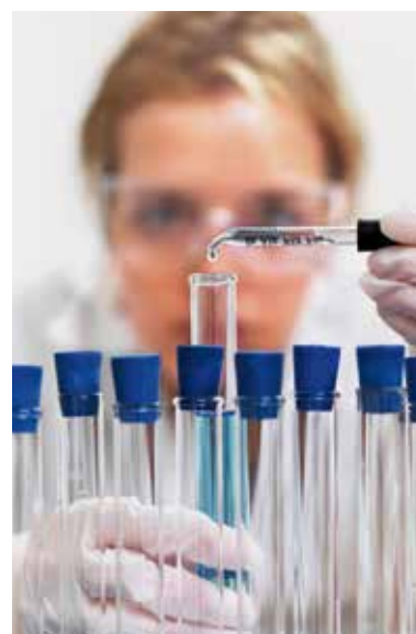
Professional material technology