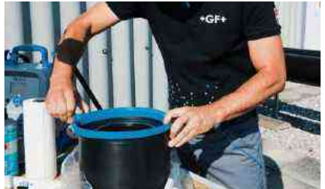
Place the assembly aid on the fitting. Stretch the sealing lip pressing the handles together.