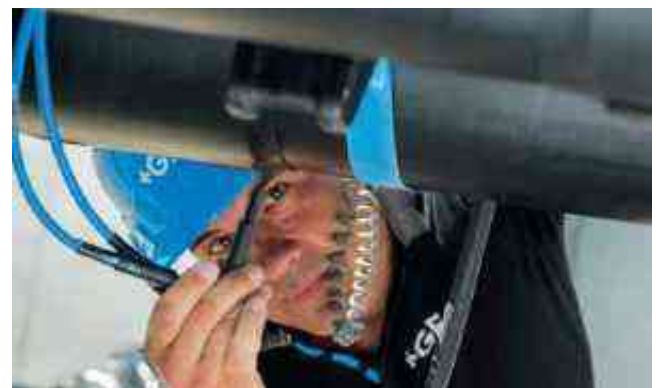
Connect the welding cables to the welding contacts of the fitting and weld according to the instruction manual.

Watch the installation tutorial video: www.gfps.com/cf4-installation