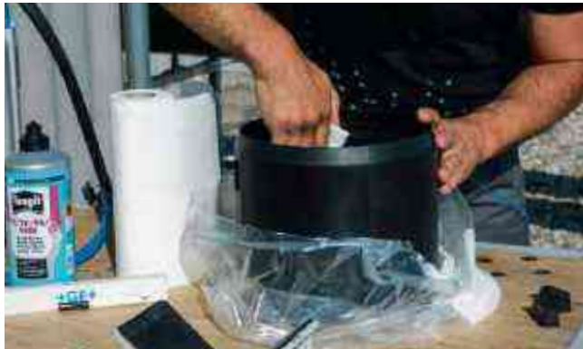
Clean the fusion zones of the fitting and pipe using Tangit PE-cleaner and a clean paper towel.

Even installers without any previous electrofusion experience find it easy to install COOL-FIT® PE Plus . We provide onsite training and certification free of charge.