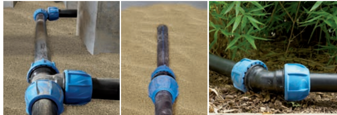
Water Distribution Lines