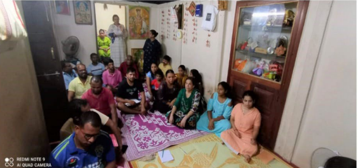
Swayamsiddha Workshop conducted for women