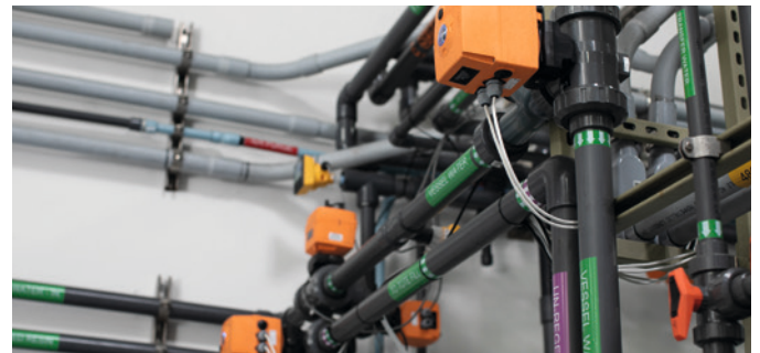
The treatment of process water has to meet very high demands. Process automation plays key role.

Telephone +41 (0)52 631 11 11 mail@georgfischer.com www.gfps.com