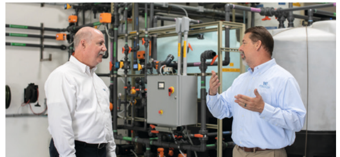
GF Piping Systems and Water Innovations are continually improving the systems.