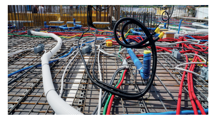
The iFIT pipes (black) are fitted for the drinking water supply to the apartments.

Georg Fischer Piping Systems Ltd Ebnatstrasse 111 8201 Schaffhausen / Schweiz