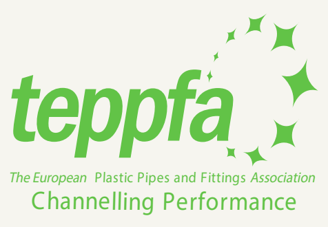
As a member of TEPPFA, GF Piping Systems promotes the sustainable character of plastic.

This universal solution covers all aspects of safety, efficiency and reliability required to build, maintain and operate industrial piping systems.