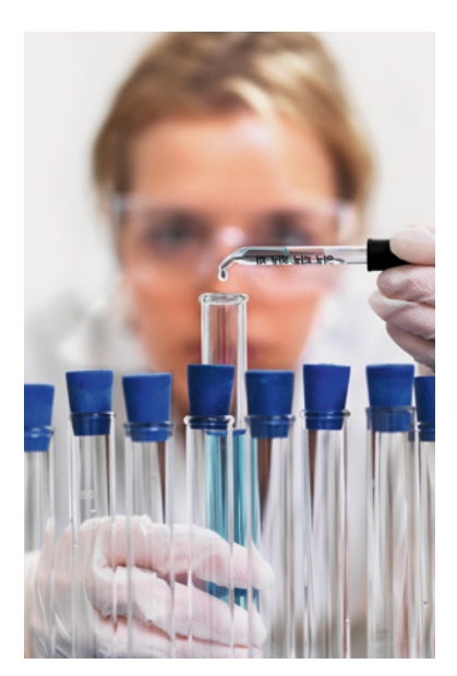
Professional material technology