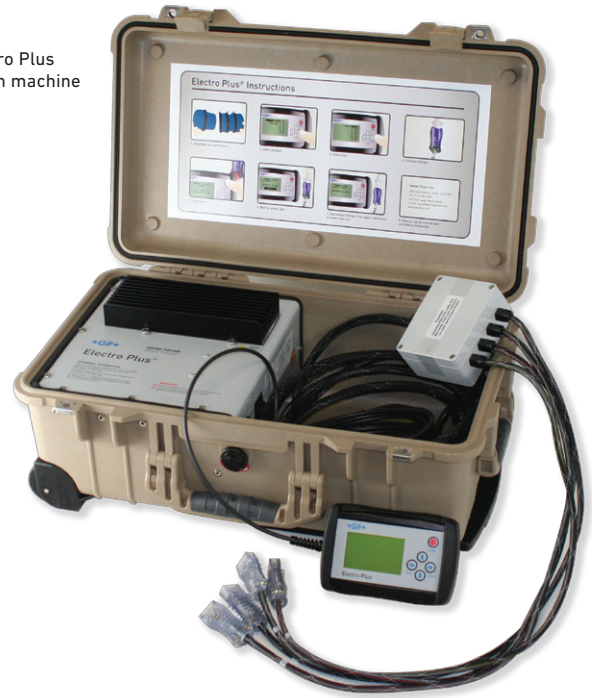
Electro Plus fusion machine

One of the advantages for installers is that one fusion machine can do all their laboratory needs: Fuseal PP and Fuseal 25/50™ for corrosive waste and in plenums, Fuseal Squared® for double containment and PPro-Seal™ PP for DI water loops.