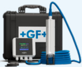
Mobile unit accessory