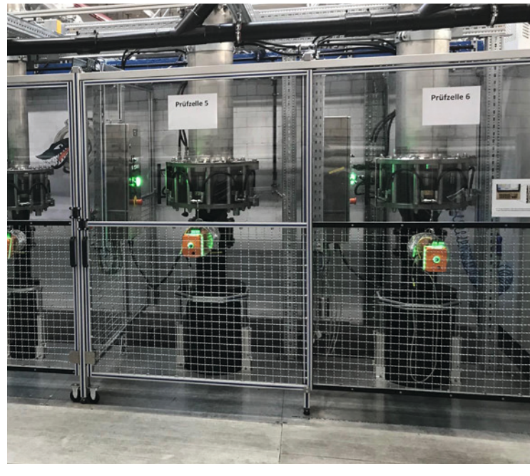
To ensure the high quality standard, the butterfly valves are tested under the toughest conditions in a test stand.

The Butterfly Valve 565 is produced by GF Piping Systems in Seewis (Grisons), Switzerland. High-quality valves have been produced here for over half a century. They combine technological innovation with the highest standards of material selection, manufacturing and quality testing for safety, durability and reliability.