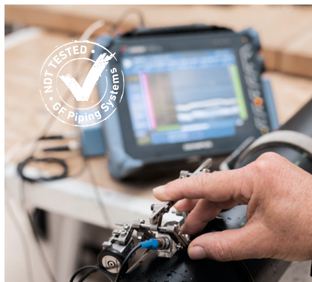
Scan butt fusion welds with our customized ultrasonic sensors

Previously, providing an assertive and reliable quality check for a plastic piping installation was no easy task. A typical pressure test does not provide any information on the long-term performance of the installation, while destructive testing, does not add any certainty about the quality of other welds that are not tested. In our approach to total quality management, we have developed the first Ultrasonic NDT solution for plastics, with a 'pass' or 'fail' statement, regardless of material (HDPE 100, RC, PP) and type of fusion (Butt Fusion, Electro Fusion, Infrared). A solution that enables you the certainty you deserve, when closing a trench or installing a pipe in your plant.