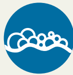
Foaming 1 & Agitation