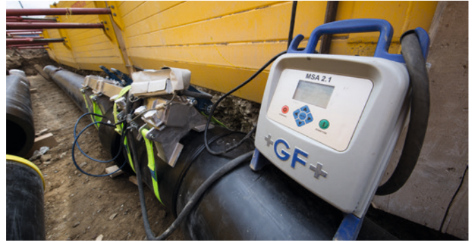
Installation of the components on site at Max Schetter AG.

A patented technology, active reinforcement, ensures the long-lasting and reliable connection of the pipes. For this purpose, the reinforcement ring is pressed over the inner ring with high forces during manufacture. During the welding process the heat reduces the stiffness of the inner ring, the reinforcement ring presses from the outside. This allows larger gaps to be closed more quickly and safely.