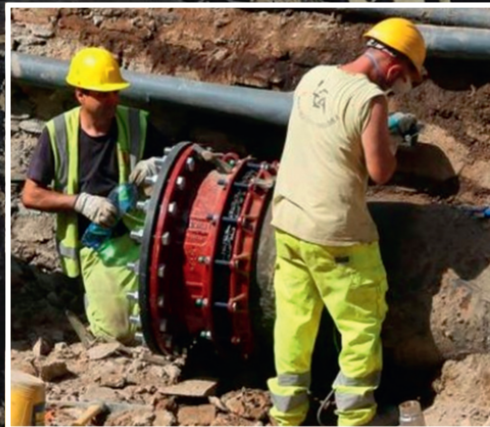
Installing the DN600 MULTI/JOINT® 3000 Plus flange adaptor