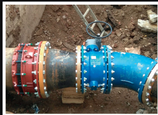
Finished bypass ensuring the supply of potable water in Florence