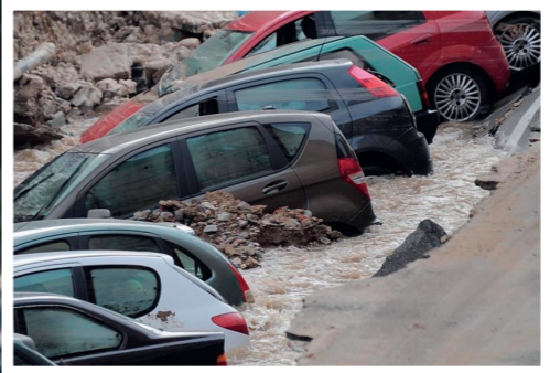
Cars in the giant sinkhole

On 25 May 2016 about thirty car owners were about to regret parking in downtown Florence alongside the quay, with a view of the Ponte Vecchio.