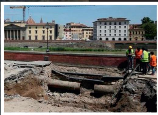
The location where the bypass would be made later on

The water company in Florence, Publicacqua S.p.A., applies the principle that new suppliers of materials must go through a tough screening before they can actually supply anything. Fortunately for the city, employees of GF Italy had brought the MULTI/JOINT® 3000 Plus system to the attention of Publicacqua S.p.A. a number of times already, so the product had already been approved for use in the network of Publicacqua S.p.A. Also other GF products, such as Primofit and Alupex Multilayer pipes have been approved for use by the water company.