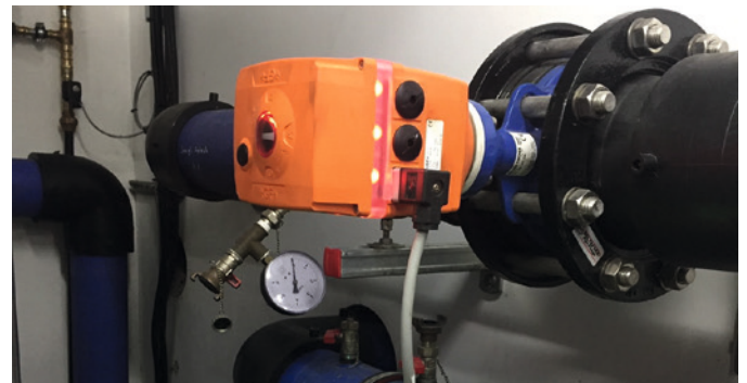
LED status display facilitates checking the current state of the actuator.

The operators chose the Smart Actuator to avoid unexpected downtimes and improve the efficiency of the water filtering system. In addition, the interoperable actuator helps the customer to future-proof the piping system. The Smart Actuator is leading the way to a decentralized water treatment future.